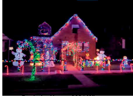
Deck the House 2021 Winner

The contest is free but requires pre-registration. First, second, and third place prizes will be awarded. Residents may enroll now for a judging on Friday, December 16, 2022 6:00-7:15 pm. Residents must have their lights on by 6:00pm for judging.